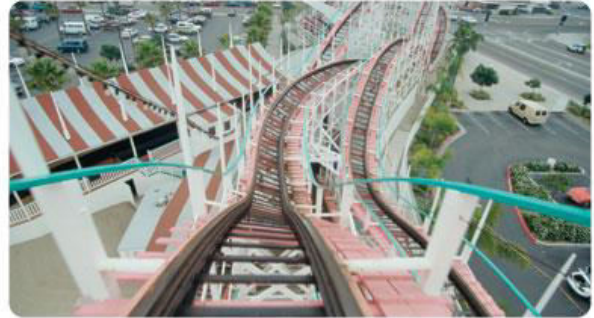
The ride was terrifying

6 I'm a bit . I have to give a presentation to the whole class tomorrow!