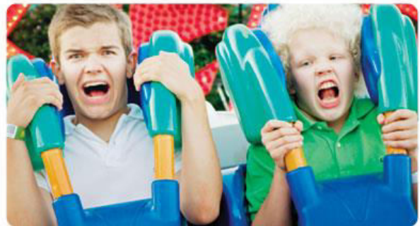
They were terrified