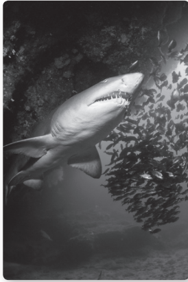
1 ..... whale shark .....