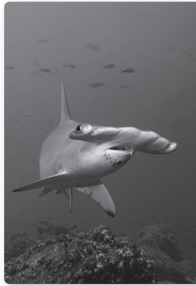
2 ..... hammerhead shark .....