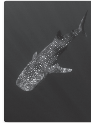
3 ..... sand shark .....