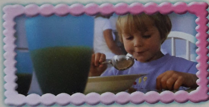
My sister usually has cereal for breakfast.