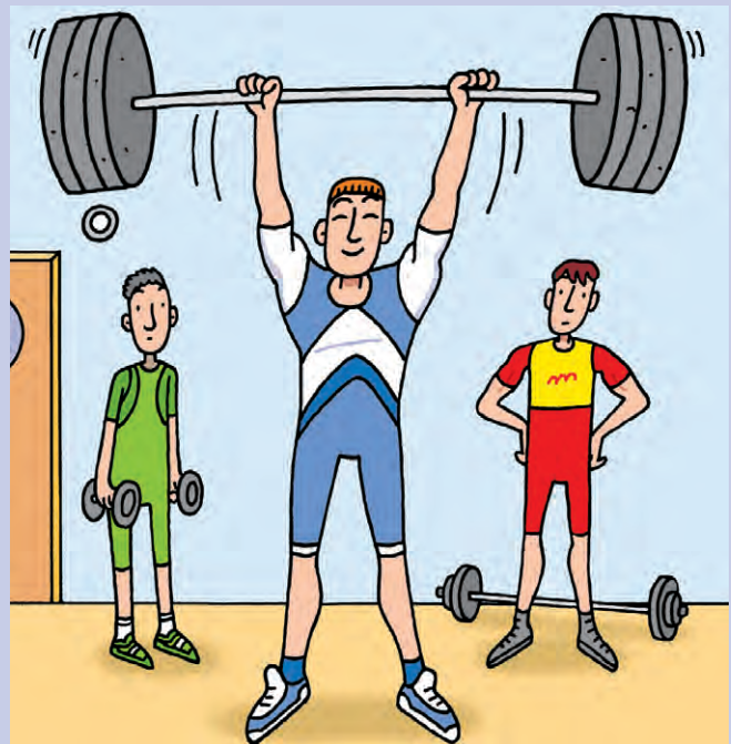
But Max is the strongest .

We use the superlative adjective with the when we compare three or more things.