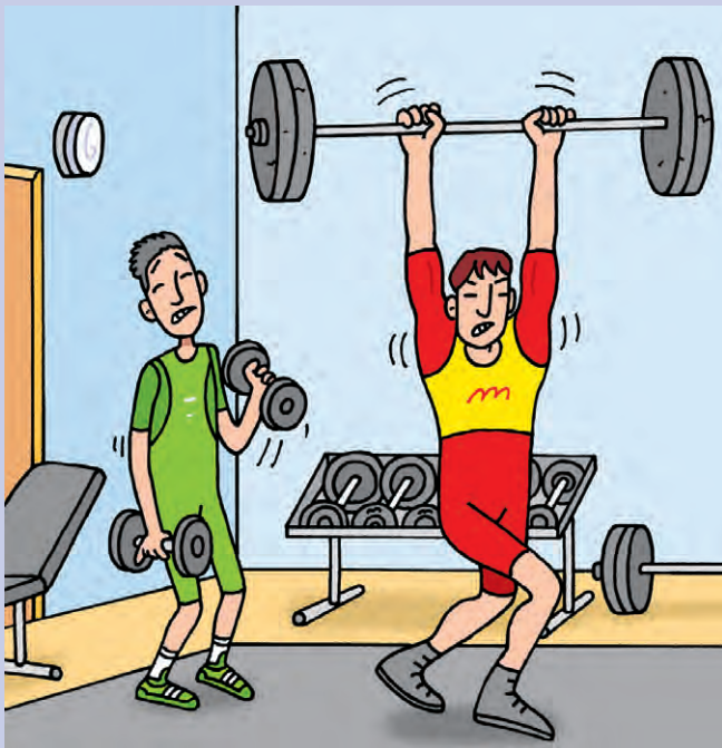
Pete is stronger than Tim.

We use the comparative adjective with than to compare two people or things.