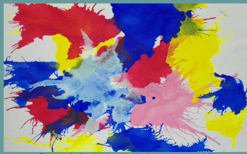
Paint explosion.