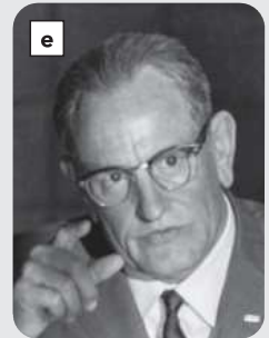
Lyndon B. Johnson in LBJ (2016)