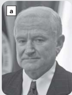
Dwight D. Eisenhower in The Butler (2013)