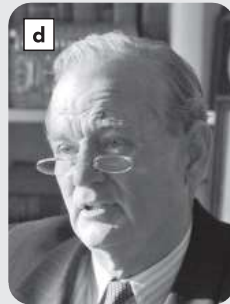
Franklin D. Roosevelt in Hyde Park on Hudson (2012)