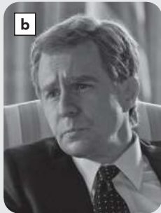
George W. Bush in Vice (2018)