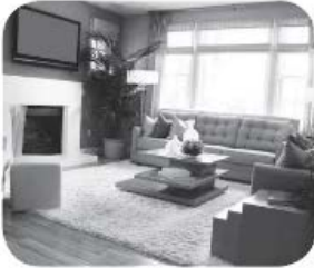
living room ?