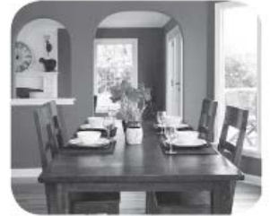
dining room ?