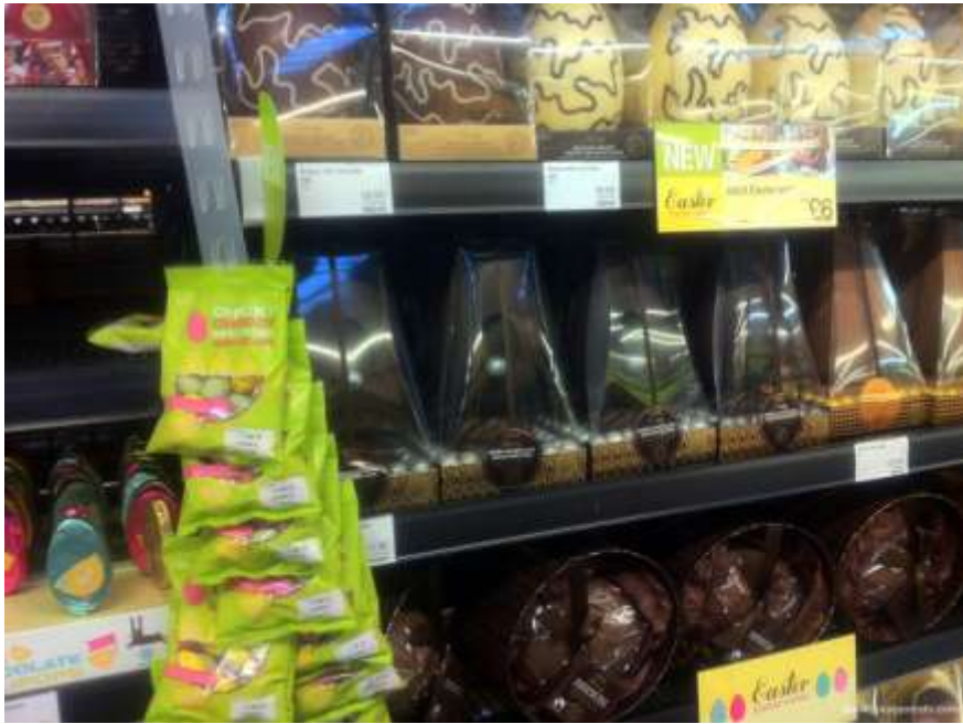
These are typical Easter egg displays in the supermarkets.