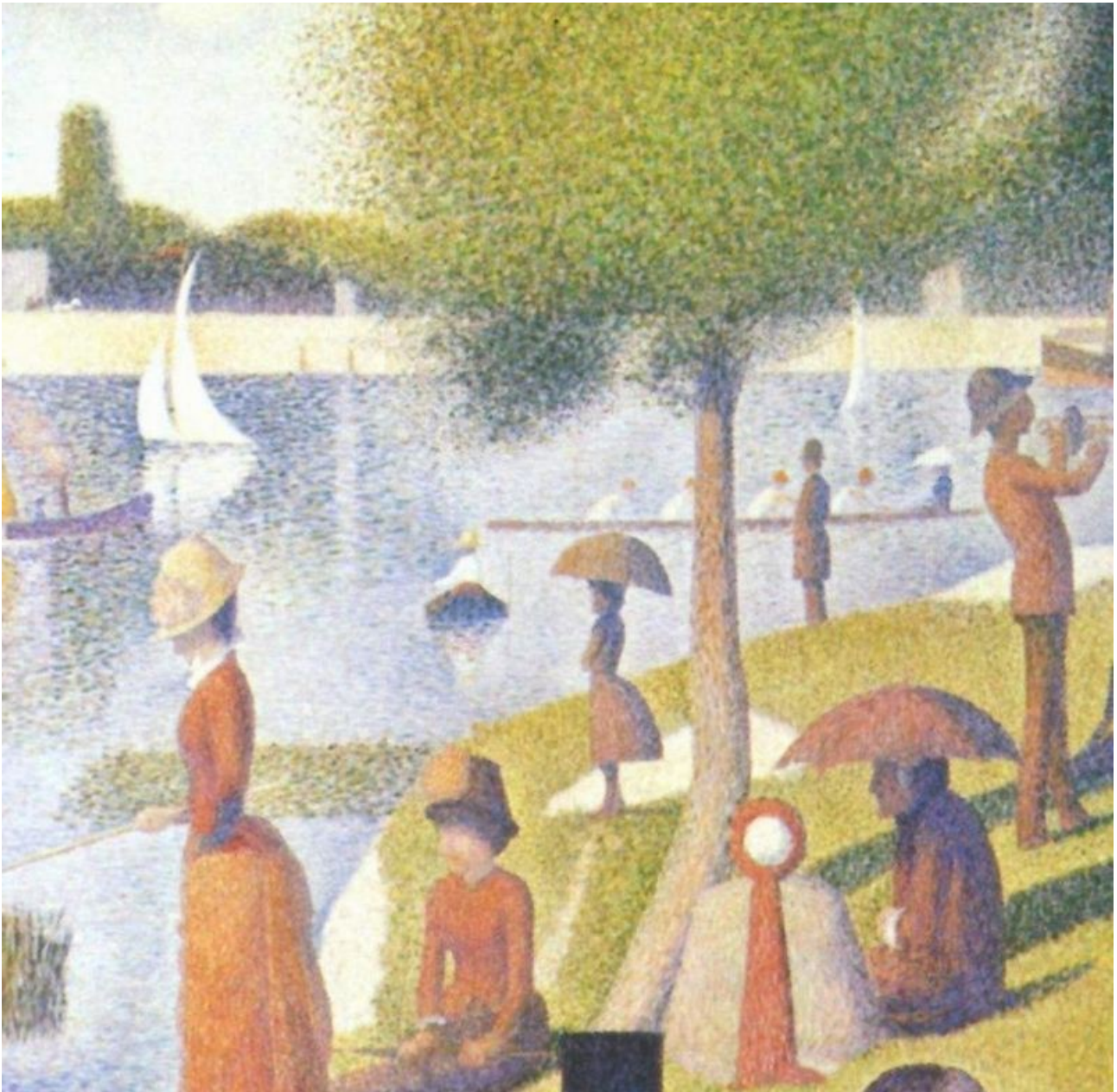
Bathers at Asnières ( Bañistas en Asnières) by Seurat

(Fíxate neste cadro pintado por GEORGES SEURAT, que está pintado con pequenos puntos e mezclando diferentes tonalidades o que fai que o noso ollo, cando mira esta obra de arte, forme as figuras, as luces, as sombras...)