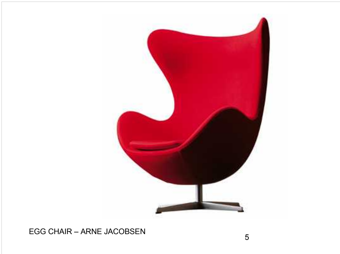
EGG CHAIR – ARNE JACOBSEN