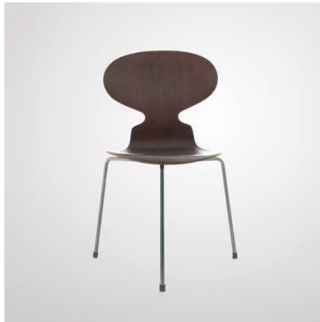
ANT CHAIR – ARNE JACOBSEN