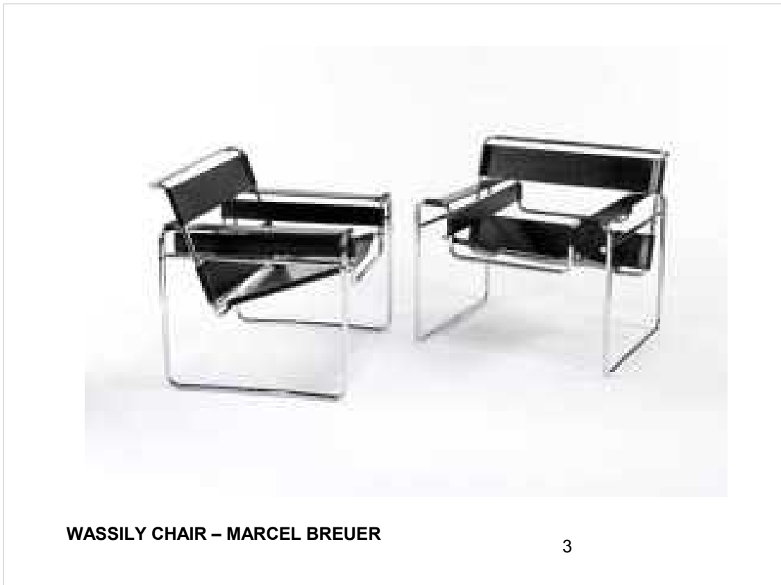
WASSILY CHAIR – MARCEL BREUER