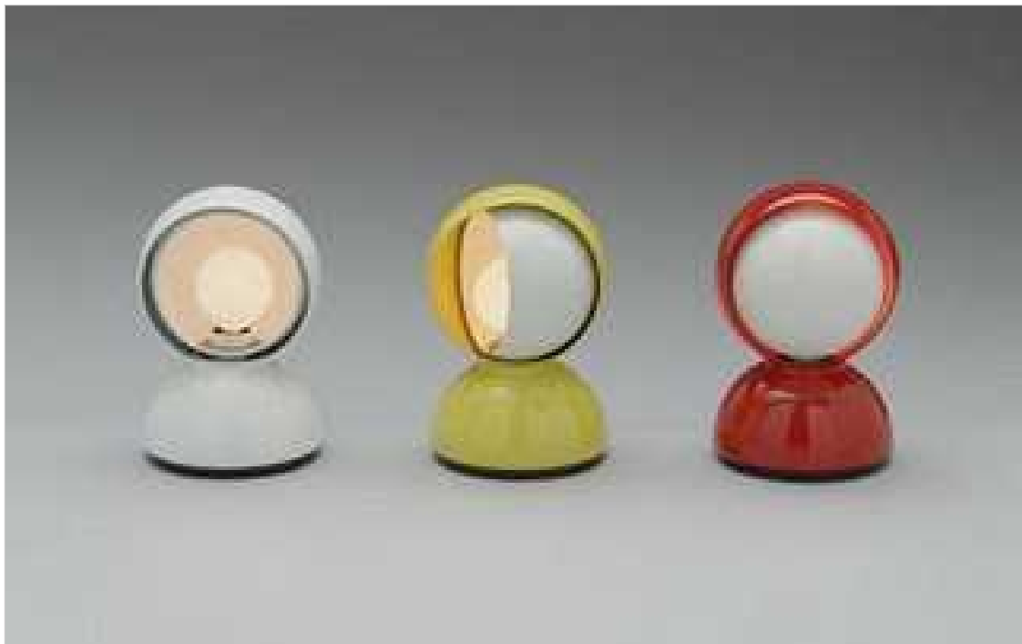
ECLIPSE LAMP – VICO MAGISTRETTI