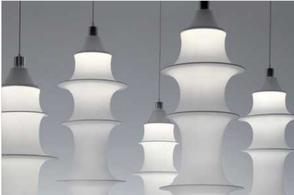
DANISH LAMP – BRUNO MUNARI